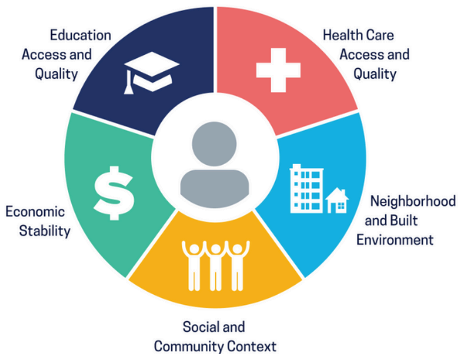
Social Determinants of Health Copyright-free